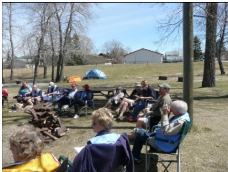
On the right: The other half of the circle of friends enjoying the birthday party.