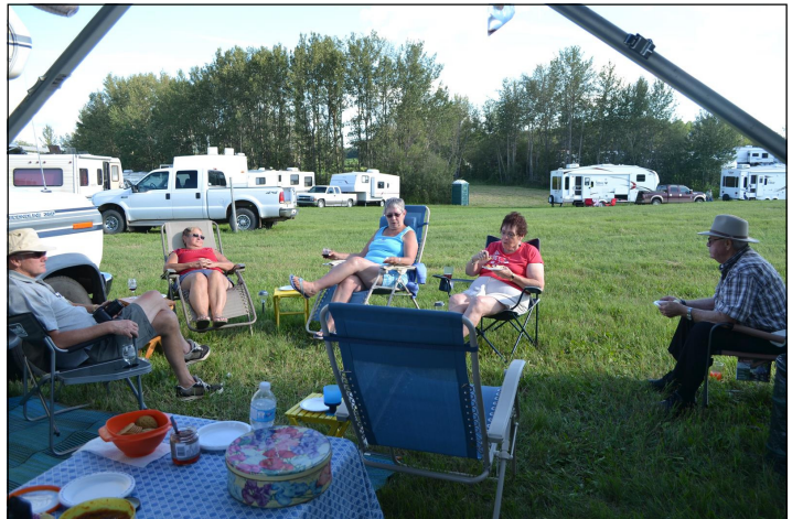
Photo above: Relaxing after a hard day's work at the Haying in the 30's annual event in support of cancer victims, Mallaig AB, August 2013