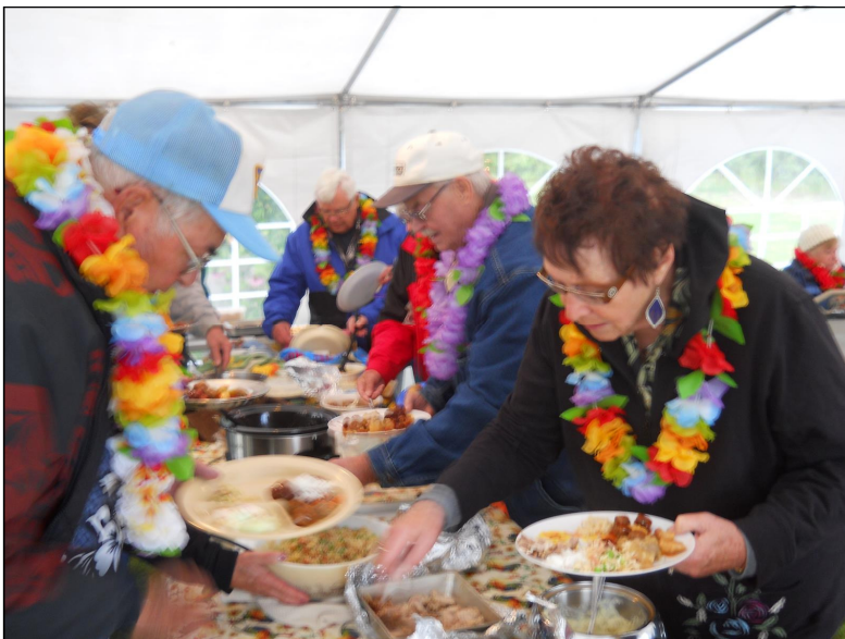
Photo on the left: Pot Luck supper at one of our campouts with a Hawaiian theme, June 2013. The weather didn't cooperate enough for us to display our fancy Hawaiian dresses.