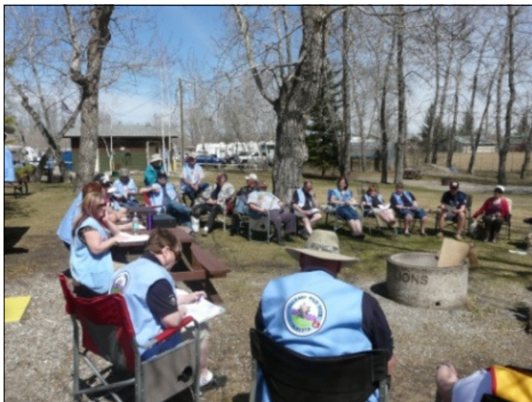
On the left: Half of the circle of friends attending the birthday party.