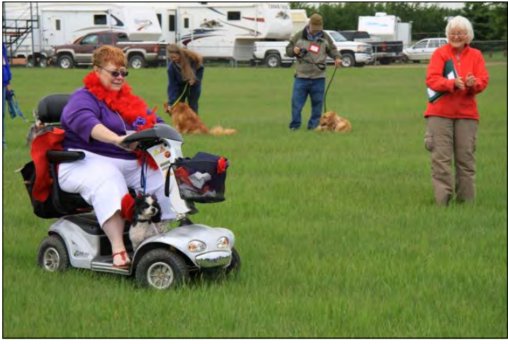
The Dog Show